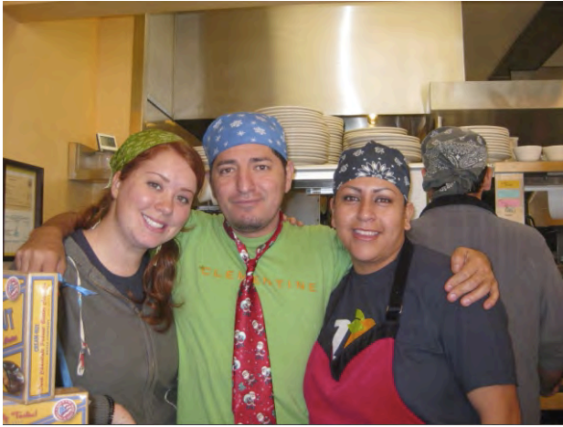
The friendly staff

We are blessed to have such a destination within walking distance of our homes. Each holiday the staff handles pick up orders while others continue to enjoy Clementine as a regular meeting place for coffee and delicious seasonal offerings and pastries.