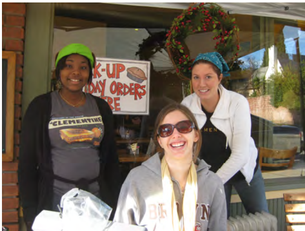
Waiting for holiday pickups